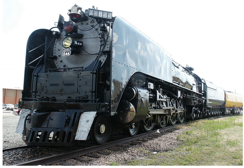
844 at Gibbon 844 in